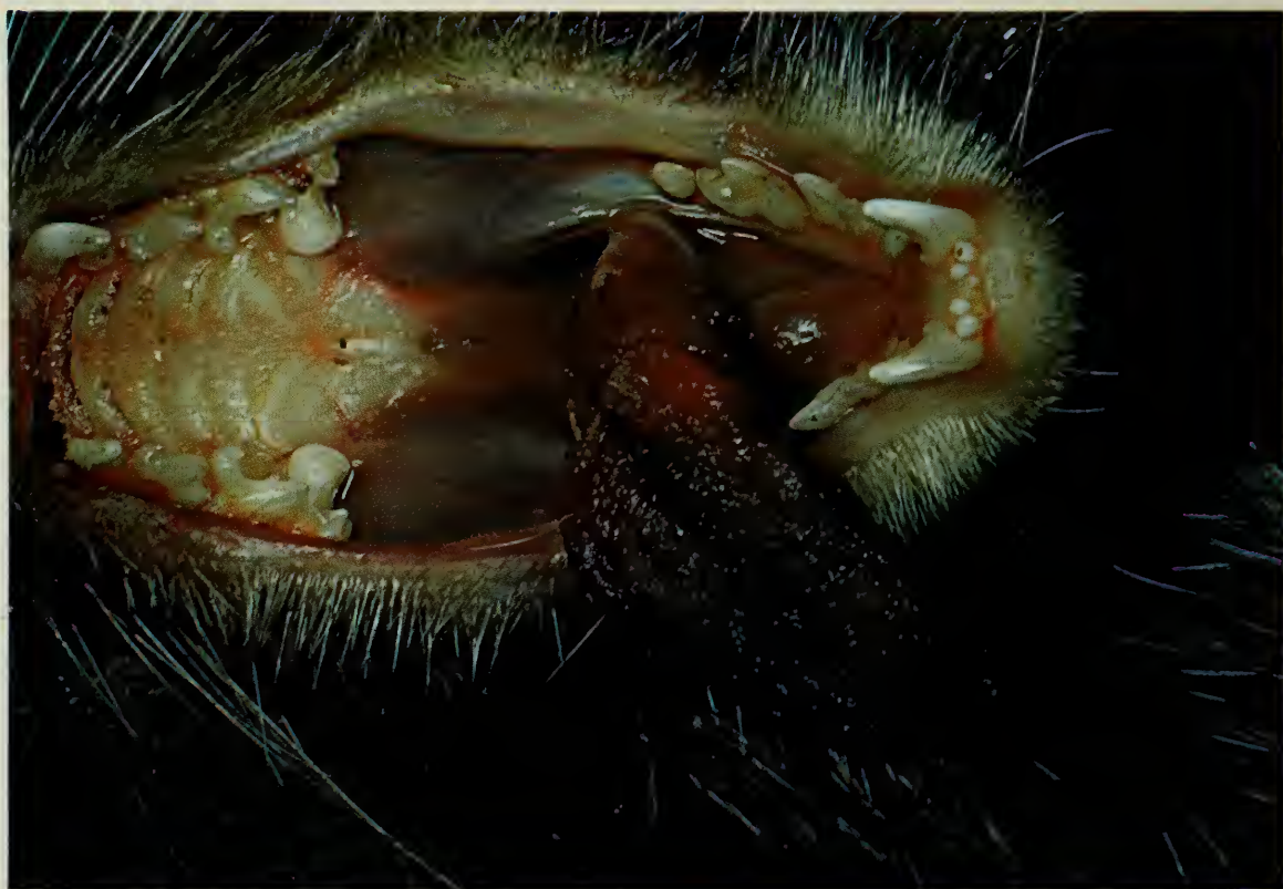
Fig. 8. Strangulation of tongue due to tracheal ring.